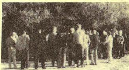
Early Morning Service at Clear Lake

After Jesus' resurrection when He confronted the fishermen disciples on the shore of Galilee, we remember what Peter's replies were to Jesus' question, "Peter do you love me?" In our best moments, our response to Jesus' question is the same. That same sorrow, pity and love has been working on my hurt and anger, regarding the furore in the United Church. Thank God that through our personal relationship with Jesus Christ and His amazing grace, it is possible for us human beings and nations to overcome fear and distrust by steadfastly practising His Love and trust in every problem of human relationships. The answer to reconciliation of individuals and nations we find in Peter's loyalty and commitment to the living person of Jesus, the Christ of History, the Son of the Living God, our Lord and Saviour, our King, our shepherd and our friend.